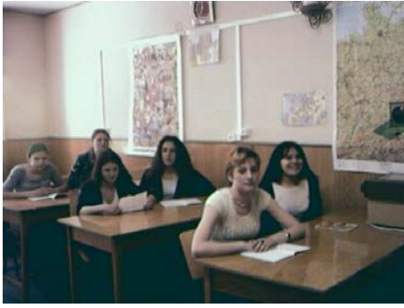
Our students are professionally well trained students.

The College has about 200 teaching staff (teachers, specialists, foremen, engineers), everybody has didactic degrees and specialisations made within the improvement programme organised under MEC coordination.